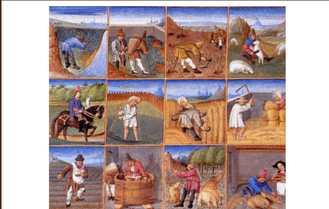
Pietro de' Crescenzi, Liber ruralium commodorum (The Book of Rural Benefits), 1304-1309