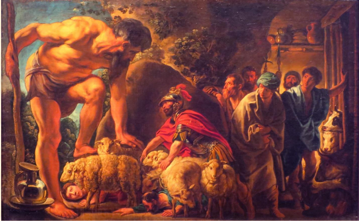
(Odysseus in the Cave of Polyphemus." Painting by Jacob Jordaens)