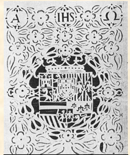
Page from Preces Latina . Devotional made for King Phillip III of Spain. Circa 1600. Paper.