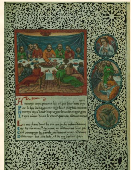
Page from Italian book of hours made for Marie de Medici, Queen of France. Circa 1600. Vellum.

You can free form cut, but drawing out what you plan to cut ahead of time allows you to erase and correct mistakes. Once a cut has been made, there is no going back. I recommend drawing on the back of the paper so that any pencil marks will not be visible on the "good" front side. You can also use a glue stick to glue a paper that has the design on it to the back and cut through both papers. Remember that cutting from the back will mean the reverse image is displayed on the front. You can use a mirror to look at your design to make sure it will look as you wish it or you can draw the design on tracing paper, flip it, then glue it to the paper you want to cut. Let glue dry prior to cutting.