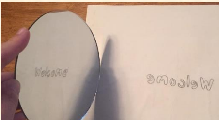
"Welcome" drawn on tracing paper, flipped, & glued to paper to be cut. Mirror shows how it will display on other side.

This method relies on cutting out paper to create contrast that allows form to emerge. The cuts usually eliminate the negative space, edges, and/or shadowed parts of the object to create the illusion of the form. Unlike applied pigments, continuity of the paper must be kept in the forefront of mind (ex. if you cut a circle within a circle what would remain is just 1 large circle).