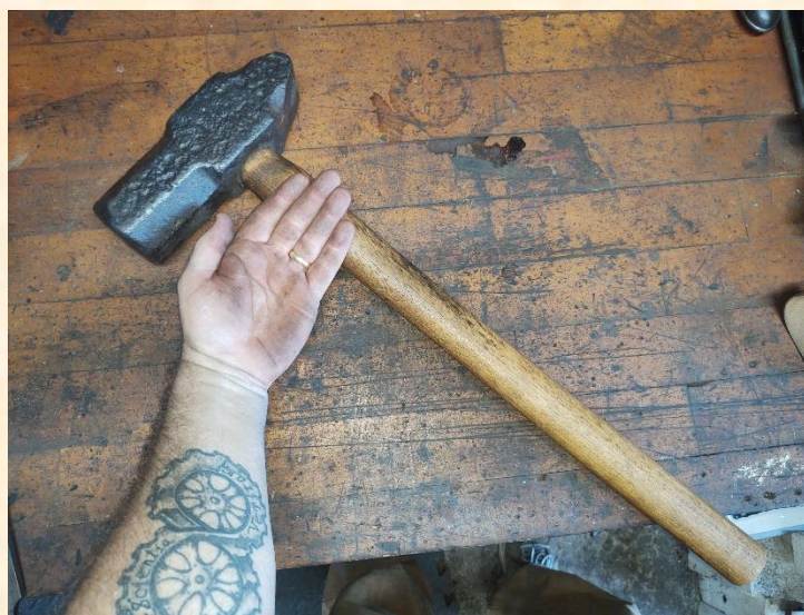
Railroad/Blacksmith sledgehammer purchased at a flea market

Where does one get their hammers? There are many blacksmith supply businesses online. However, for someone working on a budget, flea markets are a great source for basic hammers. I have found ball peen, cross peen, straight peen, and cross peen sledgehammers at my local flea market. While they take a little work to get back into decent shape, I find that the savings in money, and the learning from refurbishing them to be a better value than just going out to buy a bunch of hammers.