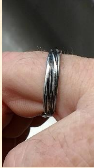
Textured ring forged by the author for SCA use

The flea market hammer finds are also cheap enough, that if I need to have a texturing hammer, I have no fear of modifying (or mutilating) the face of a $0.50 hammer. This, I would never do to my Rabenwald, des Troyit, Mountain King, or Tucker hammers. I have modified a few of my hammers into texturing hammers, and those textures can be found in the SCA.