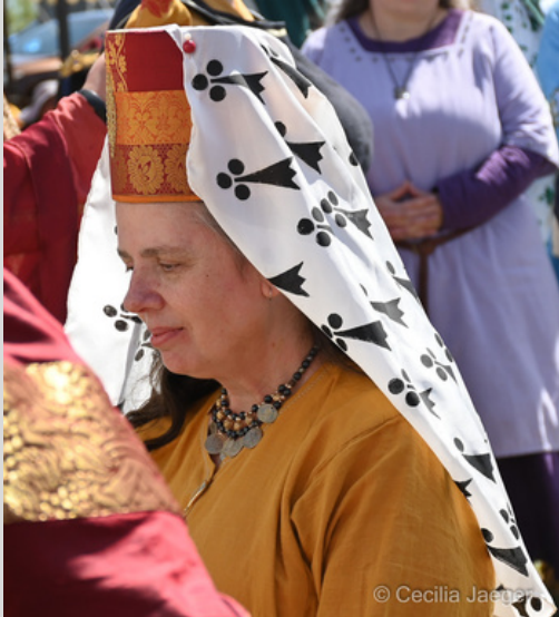
Baroness Delia Flammen - Order of the Pelican

Coronation - First Court of Cuan and Adelhait - April 2, 2022