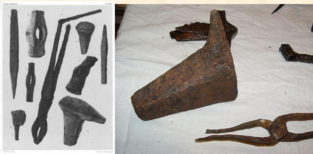
Tools from the Mastermyr Find

With a very short history in the previous article, let's get into anvil styles. While most anvils share similar qualities, specific industries used the tools that worked best for them. A traveling smith's needs were different than one permanently in a town or Lord's employ; a red smith's equipment was specialized for copper houseware, while a white smith's tools were smaller for fine engraving and forming of precious metals.