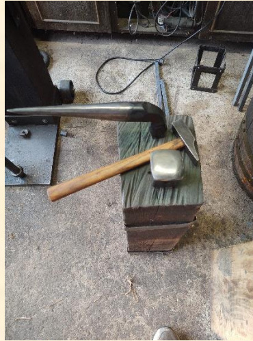
My personal period anvil, bickern, and hammer

than the hammers that strike the material. However, as the use of iron became more and more common in everyday society, larger tooling was needed, including larger anvils to handle larger products. For example, the ironwork on the doors of Notre Dame in Paris would be too large for a small anvil to handle.