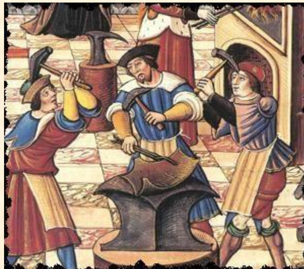
Master Armourer and Apprentices. Note the specialized anvils.

As society progressed and towns grew into thriving cities, the blacksmith shop grew as business increased. This necessitated a need for more blacksmiths and in period the only way to create new blacksmiths was training new ones, and so apprentices were taken on. Multiple apprentices and journeymen meant more equipment.