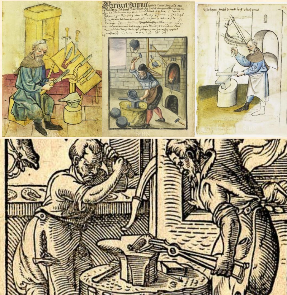
Examples of anvils in the Middle Ages that resemble modern anvils

In this image you can see anvils of different types. In a larger shop, more anvils were used for the all of the different needs of various items created by the shop. In conjunction with the proper tooling, an anvil can create anything that the smith can imagine.