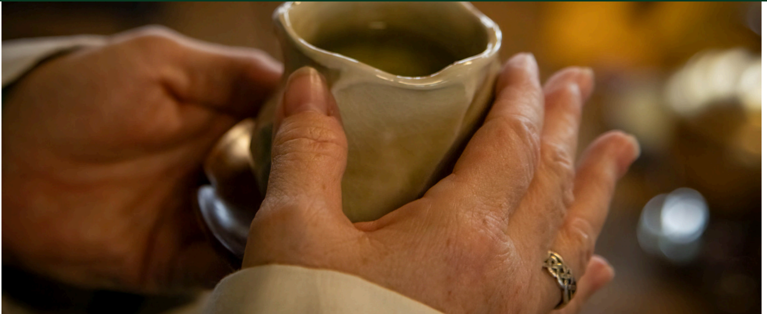
Cover photo: Machteld Cleine, Korean tea ritual at Ymir